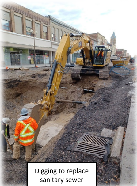
Digging to replace sanitary sewer